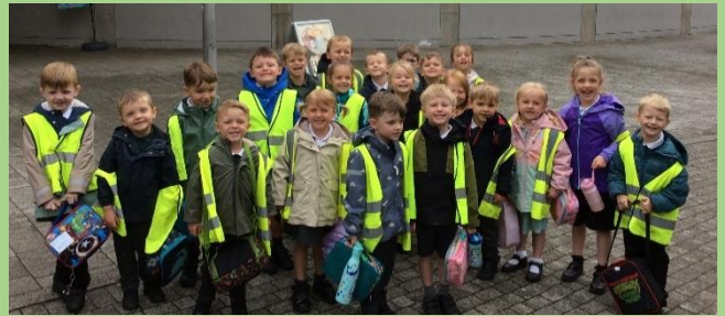
Holly Class on their first Class trip! 😊

'Striving to be the best version of ourselves.'