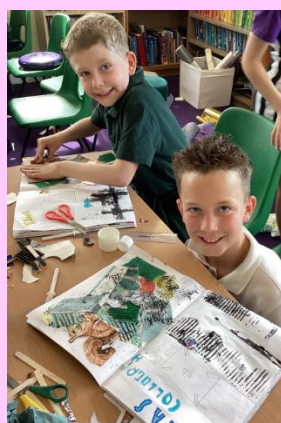
Well done Year 5