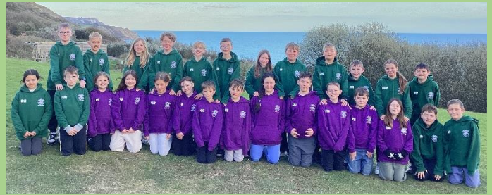
Year 6 on camp 😊

'Striving to be the best version of ourselves.'