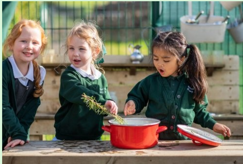
Celebrating Religious Festivals