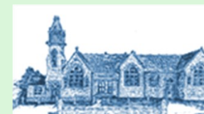
Box Church of England Primary School