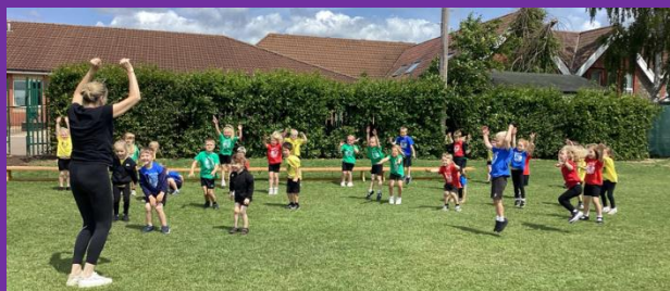
Holly Class warming up for their first Fun Run @ Redfield Edge! 😊

'Striving to be the best version of ourselves.'