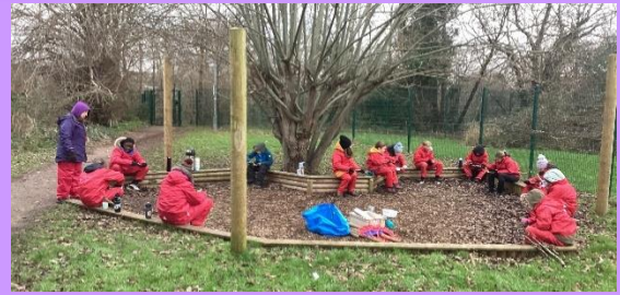
Nature Explorers braving the cold and enjoying much needed outdoor learning time.

'Striving to be the best version of ourselves.'