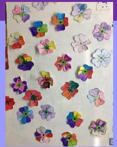
Year 3 Poppies