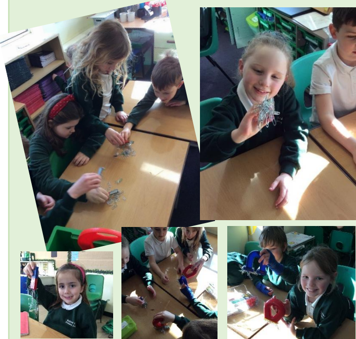
Willow Class have worked so hard recently – Miss Cole is very impressed! 😊

Willow Class have been working scientifically this week! Below you can see their enquiry lesson based on determining magnet strength. The children tested the number of paper clips each magnet held and concluded the strength based on this.