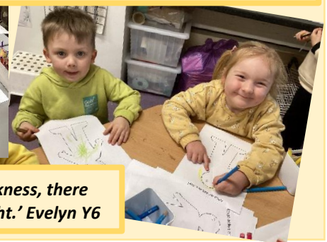
'If there is no darkness, there cannot be any light.' Evelyn Y6