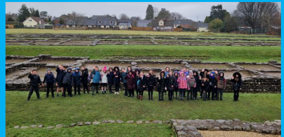
Beech Class at the Roman Amphitheatre in Caerleon.

'Striving to be the best version of ourselves.'