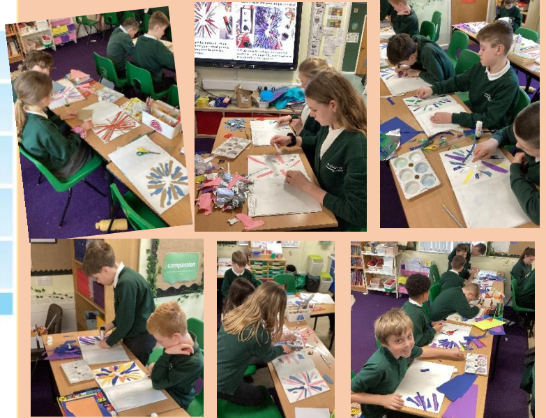
I cannot wait to see their finished artwork! 😊