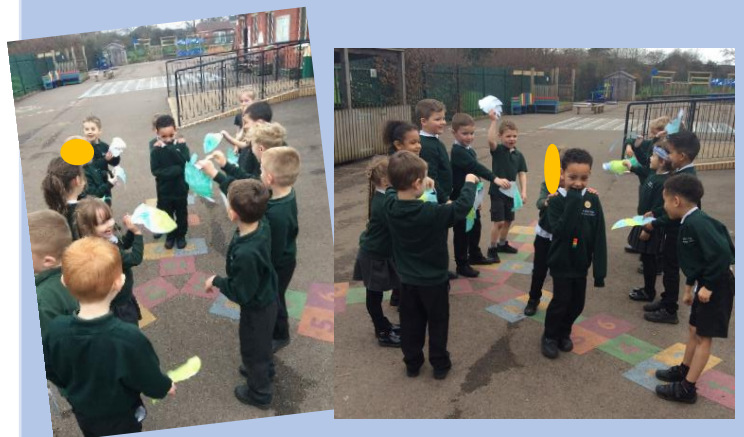
We then re-enacted Jesus arriving in Jerusalem on a donkey.

Year 1 have explored Palm Sunday in RE this week. The children read the book 'Dan the Donkey' and talked about why the people were excited for Jesus to arrive.