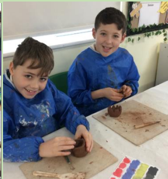
They had great fun getting creative and becoming food connoisseurs! Their outfits were also fantastic!