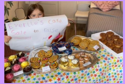
Friends of Redfield Edge 2024 challenge! 😊

We have had some great examples of children raising money. Thank you 😊