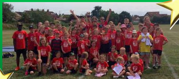
Photos of the week – Sports day WINNERS 2023

'Striving to be the best version of ourselves'