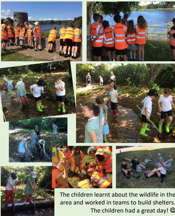
The children learnt about the wildlife in the area and worked in teams to build shelters. The children had a great day! 😊

The children in Beech Class had a great day. They toured the reservoir and went pond dipping.