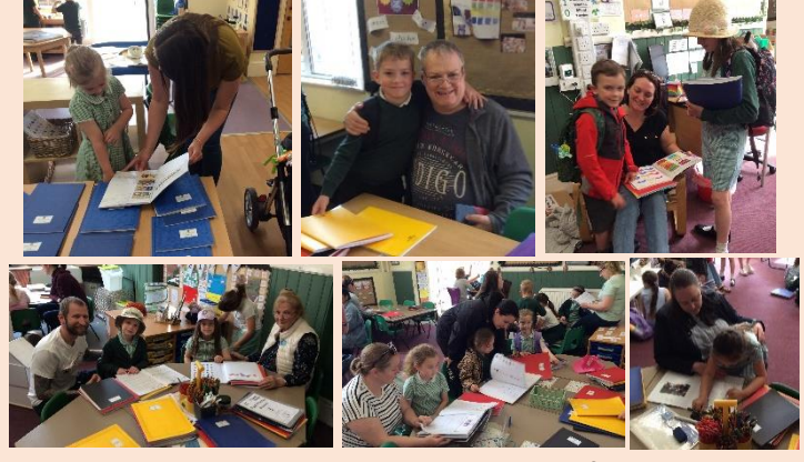
Thank you to the parents who came along and for your ongoing support. ☺

We plan on another open classroom next term.