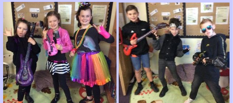
(Leader board - TT Rockstars battle on the day)

We were all so impressed with the effort made by the children coming to school dressed up. I am sure you will agree, they look great!