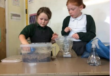
They added some strawberry tops and banana skin and sprayed the soil with water.