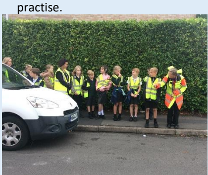
The children who took part in both sessions passed the course and received a certificate. Well done!