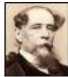
Charles Dickens (1812-1870)

Charles Dickens was a writer, who is widely regarded as the greatest novelist of the Victorian era. His works, including Oliver Twist , Great Expectations and A Christmas Carol were extremely popular during his lifetime, and have gained even further recognition since. His novels often dealt with the harsh social conditions experienced by the poor at the time, critiquing the attitudes of those with power and wealth.