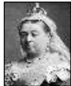
Queen Victoria (1819-1901)

Charles Dickens was a writer, who is widely regarded as the greatest novelist of the Victorian era. His works, including Oliver Twist , Great Expectations and A Christmas Carol were extremely popular during his lifetime, and have gained even further recognition since. His novels often dealt with the harsh social conditions experienced by the poor at the time, critiquing the attitudes of those with power and wealth.