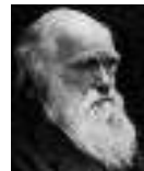
Charles Darwin (1809-1882)

Charles Darwin was a naturalist and biologist who is best known for his theory of evolution. Darwin established that all species share common ancestors, and that natural selection has shaped the diversity of life on earth. Whilst his theories were initially rejected by many in scientific, religious, and public circles, they are now broadly considered as scientific fact. Darwin has been described as one of the most influential figures in history.