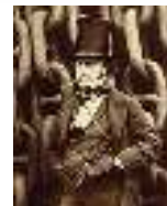
Isambard Kingdom Brunel (1806-1859)

Charles Darwin was a naturalist and biologist who is best known for his theory of evolution. Darwin established that all species share common ancestors, and that natural selection has shaped the diversity of life on earth. Whilst his theories were initially rejected by many in scientific, religious, and public circles, they are now broadly considered as scientific fact. Darwin has been described as one of the most influential figures in history.